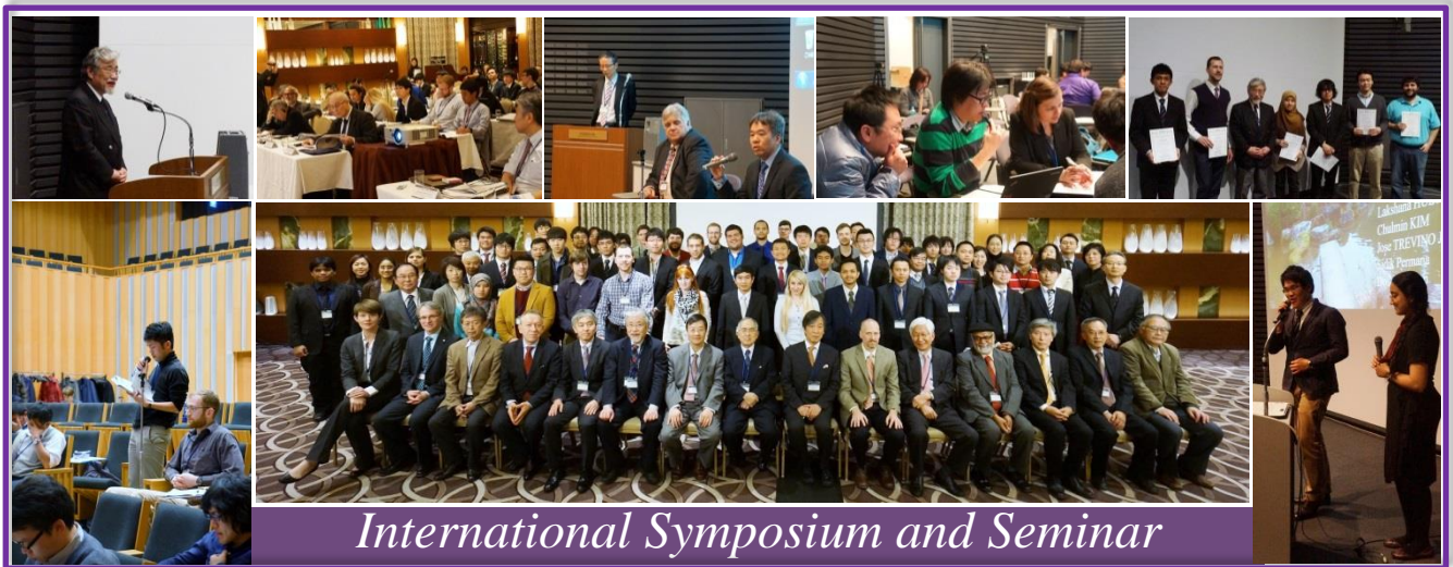
International Symposium and Seminar

The Academy for Global Nuclear Safety and Security Agent is running a "boarding school with a new and unique nuclear education (DOJO for Global Nuclear Safety and Security)." U-ATOM is a combination of the capital letter of "Unique" and ATOM.