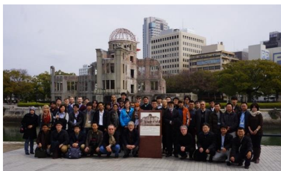
▲Hiroshima Peace Memorial Park