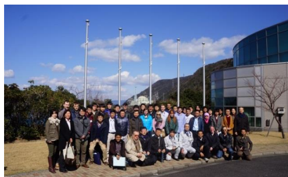
▲Monju Fast Breeder Reactor

After the briefing at Monju, the attendants divided into a Japanese group and a foreigner group and took a tour of the reactor. In the Sodium Handling Training Building, participants observed a tumbling granulator, combustion experiment facilities, fire extinguishing training facilities, and more, as well as experiencing a lump of sodium at room temperature being cut in the air with a knife. Participants toured the secondary cooling system pipe room where the 1995 sodium leak accident occurred, the air cooler room where decay heat removal is performed through natural circulation, the central control room, the simulator room, and more. It was a chance to think deeply about the future role of Monju and nuclear safety.