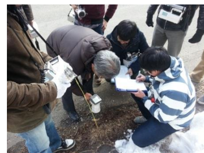
▲Field work being performed