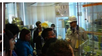
▲Visit and Observation